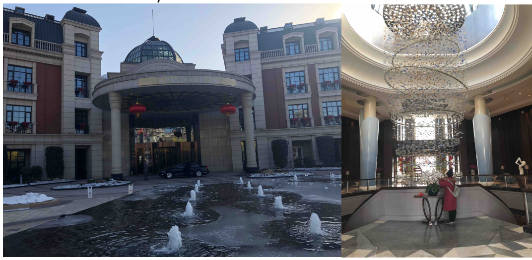
Hotel Grand Ball Room