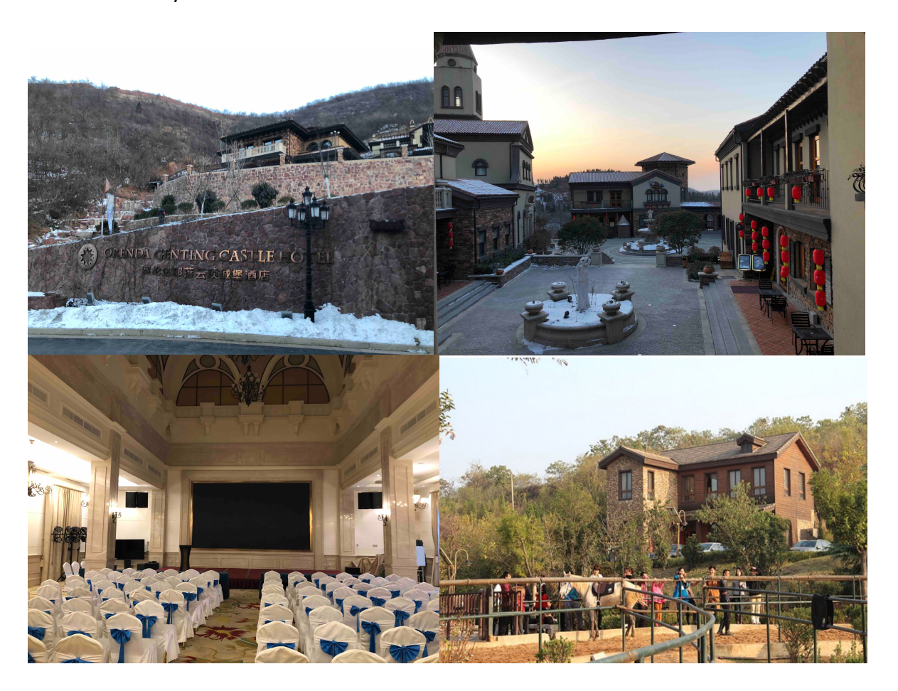
Day 6 – April 29, 2018